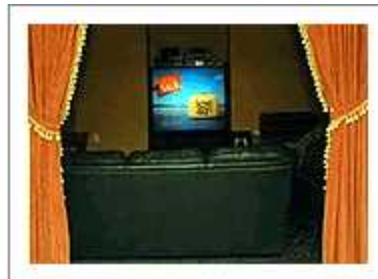
Our Home Theater