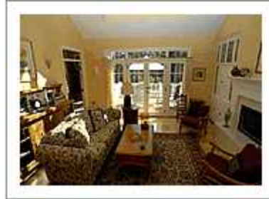
Relax in the Living Room