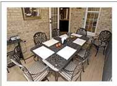
Breakfast on the Patio