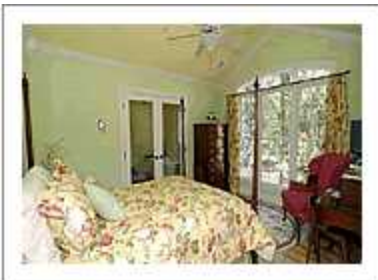
The Beech Suite